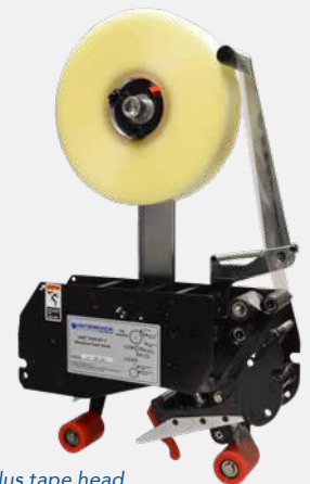
ET 2Plus tape head

When you compare features, benefits and value, Interpack™ Case Sealers are the right choice for operators, plant engineers, maintenance and purchasing.