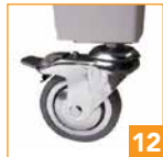
Optional swivel & locking casters