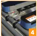
Twin 1/3 HP gear motors to process up to 85 lb cases