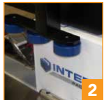
3-wheel top squeezer