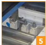
No case length adjustment necessary