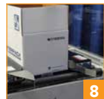
Standard indexing gate