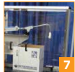
Standard interlocking safety shields (operator side)