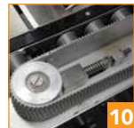
Self-tensioning & self-tracking drive belts simplify belt replacement