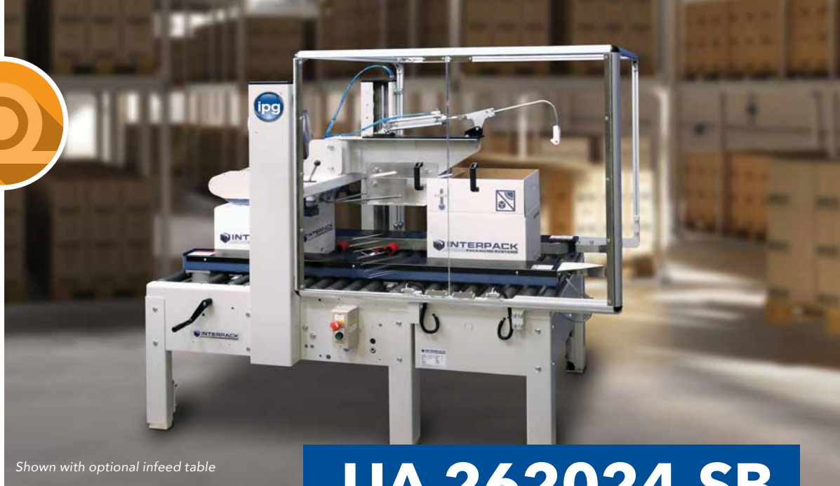
Shown with optional infeed table