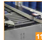
Side belt drive secures the case during processing