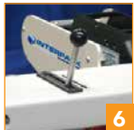
Single handle locks upper head to both columns