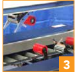
Offset tape heads process cases as low as 3.5"